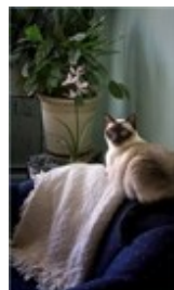
Nala the Innocent