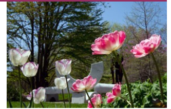
The Garden of Sculpture

I reluctantly moved to NJ eight years ago - and wish I were back on Long Island - but that's another matter. My "immigration" [it is like a foreign country] to the Garden State has at least allowed me several opportunities to go to the Grounds for Sculpture and Rats. We go into Princeton quite frequently. Princeton is a great town and the campus is extremely interesting. While there stop in to a clothing store on Nassau Street (the main drag) called Landau's Woolens. Walk to the very back of the store and see the Einstein Museum. It's not really a museum as you would picture a museum. It's more like a mini-mini museum with authentic memorabilia, letters, photos, etc. If you want a quick beer go down to the rathskeller of Triumph Brewing Company - the food is good too!