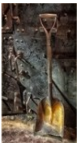
Durango Railroad Museum