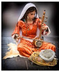
Jerusalem Street Musician